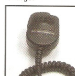
Remote Speaker Microphone