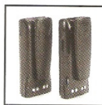
Battery & Belt Clip