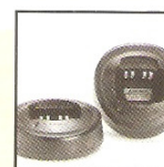
Rapid-rate Desktop Charger